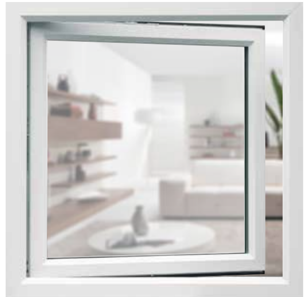
SIDE-HUNG FOR EGRESS AND CLEANING