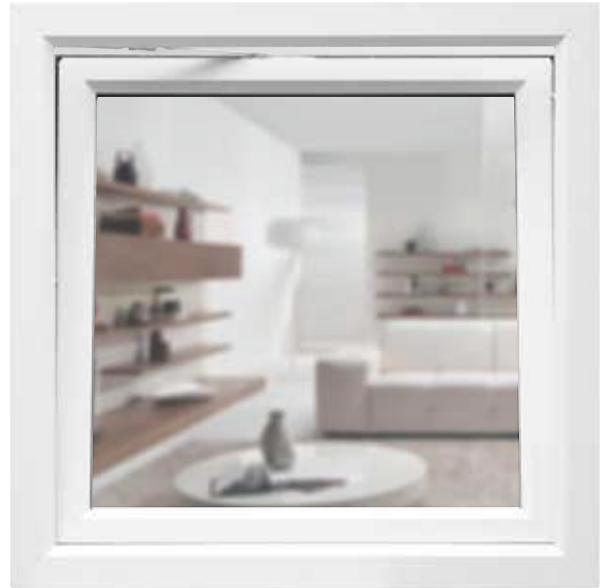
BOTTOM - HINGED TILT FOR VENTILATION

As each sash opens inwards, it means you can clean the external face of the windows from indoors - no ladders, no hassle. This makes them ideal for inaccessible locations where a ladder wouldn't be able to reach.